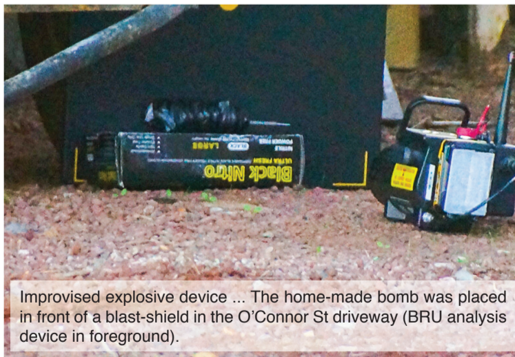
Improvised explosive device ... The home-made bomb was placed in front of a blast-shield in the O'Connor St driveway (BRU analysis device in foreground).

Police enquiries are ongoing, and anyone with any information regarding either incident is urged to contact Cobram CIU.