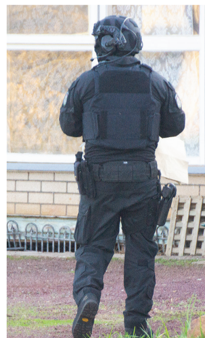
Bomb Squad ... A Bomb Response Unit officer donned protective clothing before neutralising the device.

NUMURKAH AND DISTRICT LOCAL PHONEBOOK 2019