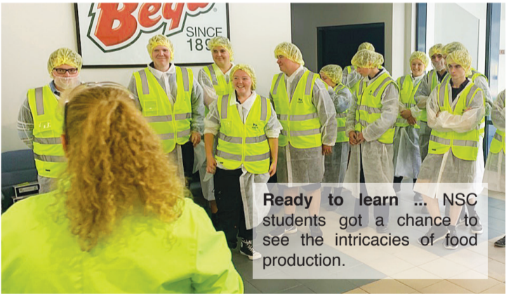
Ready to learn ... NSC students got a chance to see the intricacies of food production.

"Local industry needs employees, and they are keen to encourage young people to stay in the local area and be part of local industry. Young people need jobs so they can build a strong future here and this is a way for local industries, and local schools, to show them how they can do that."