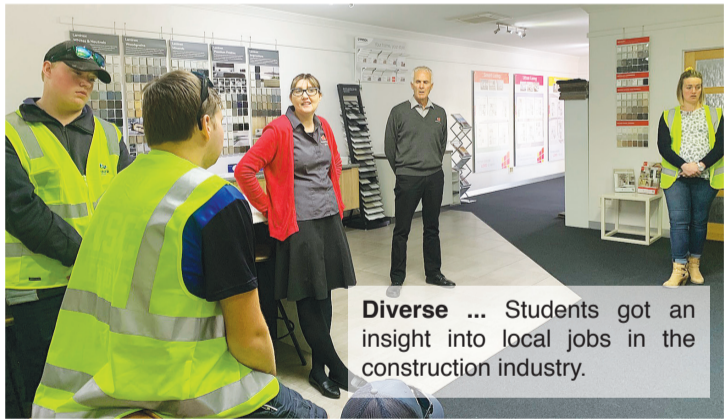
Diverse ... Students got an insight into local jobs in the construction industry.