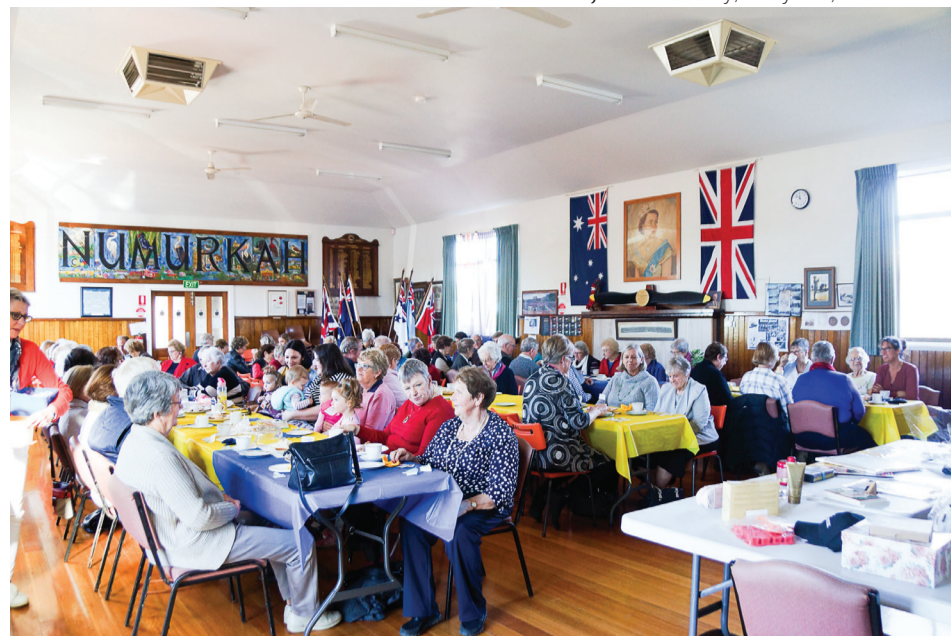
Charitable gathering ... People of all ages gathered to enjoy each other's company and raise money for cancer research.