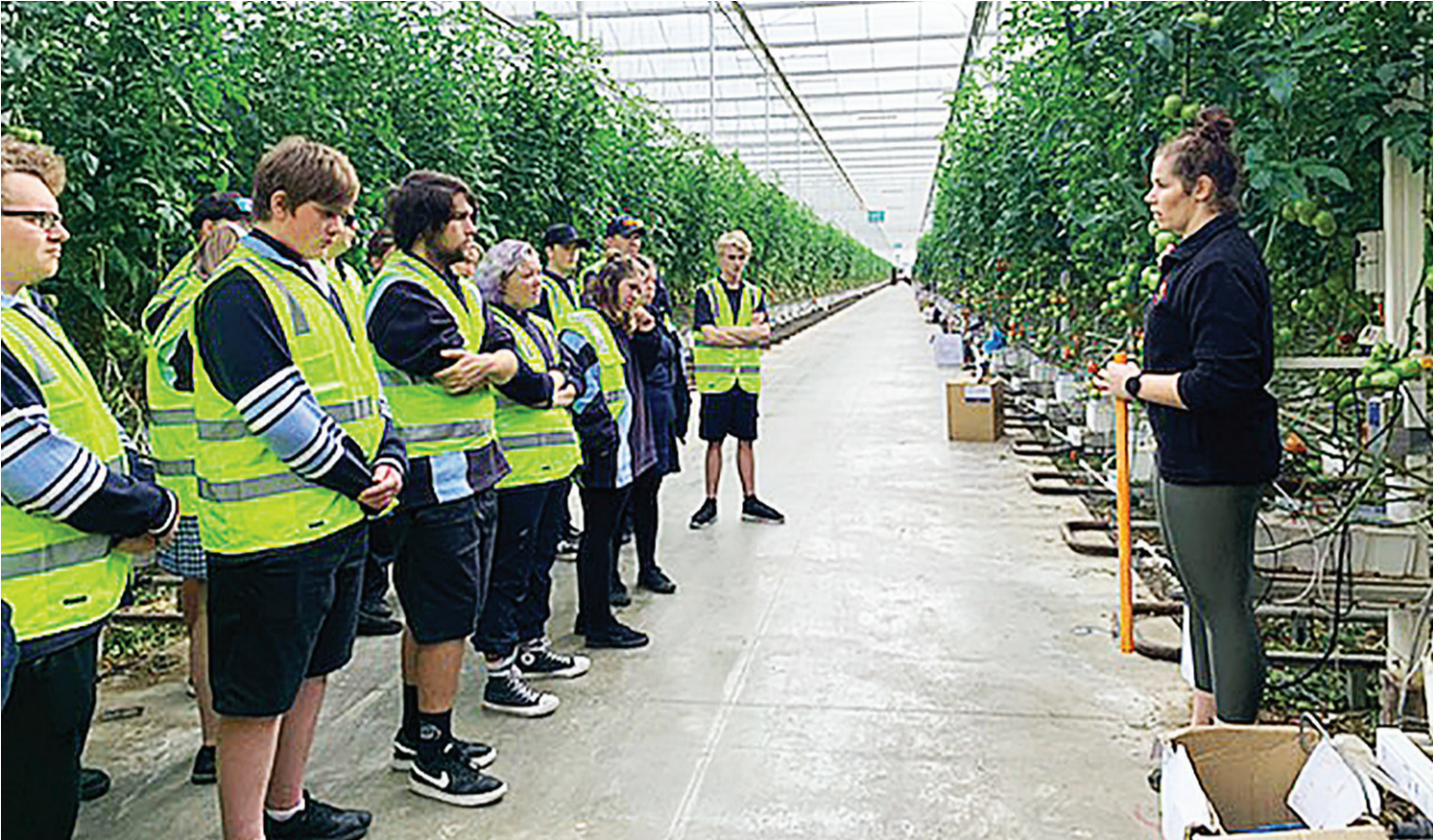
Large scale operation ... NSC students were surprised by the scale of this horticulture industry right on their doorstep.

If you or a family member has immediate concerns or requires assistance, contact beyondblue on 1300 224 636 or Lifeline on 13 11 14.