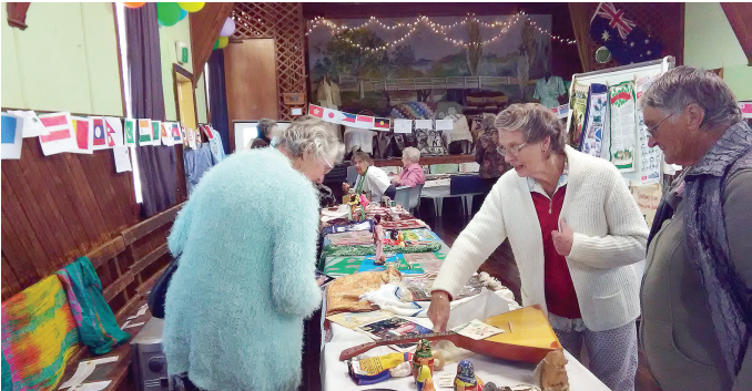
Great display ... Around 70 visitors enjoyed the display of items from around the world.

Around 70 people attended the event, which ran from 11am to 7pm. "We had a lot of people come quite late in the day and say that they were grateful for us being open late, as they wouldn't have been able to come otherwise." The event raised almost $500 for ACWW's Pennies for Friendship initiative. Pennies for Friendship maintains the hub of ACWW's work, and contributes to projects assisting disadvantaged rural women across the globe. "When we went to the conference in India years ago we visited a poor area where the women showed us a water tank with a tap they could get clean water from," June said. "The women were just thrilled with it, and that had been paid for by Pennies for Friendship so we are always excited to be able to contribute to the program."