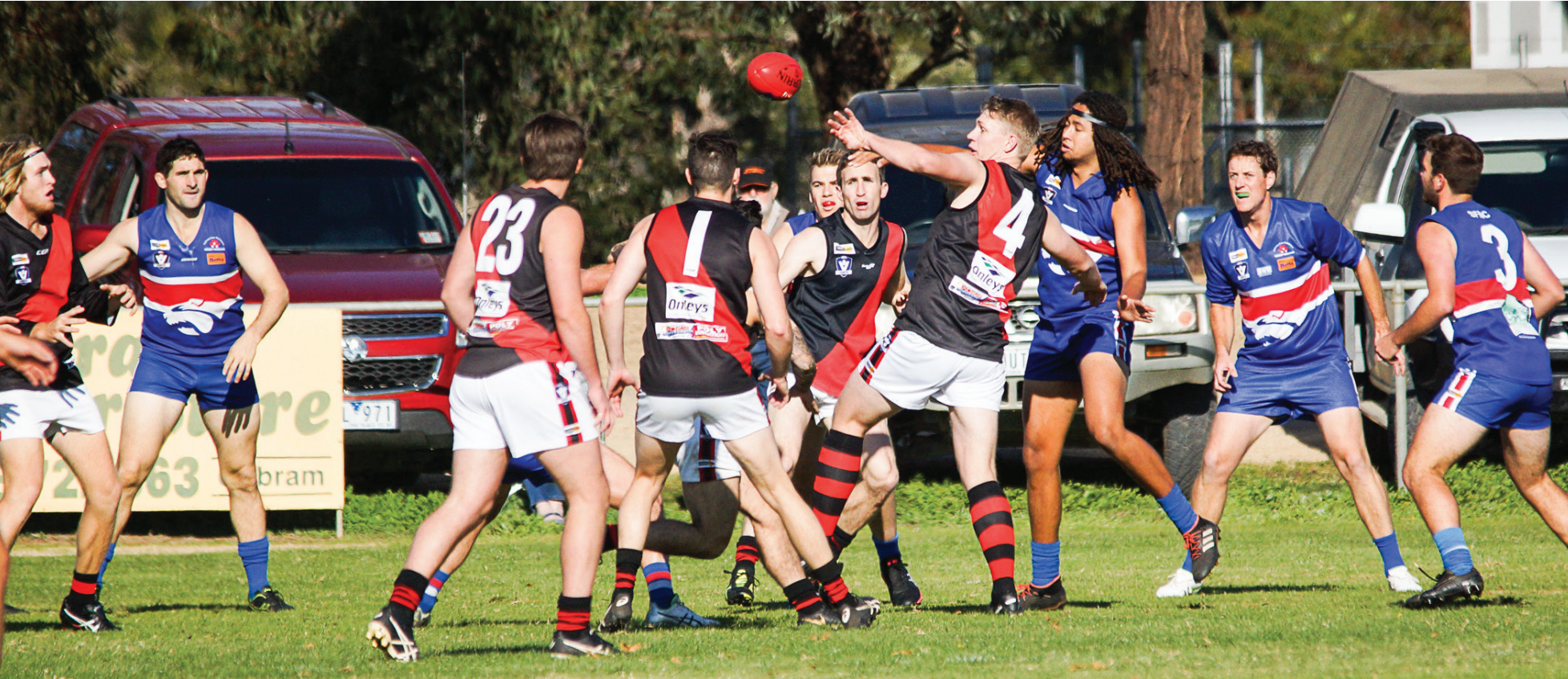
All in ... There was plenty of action at Strathmerton when the Bulldogs met Waaia in a top of the table clash on Saturday.