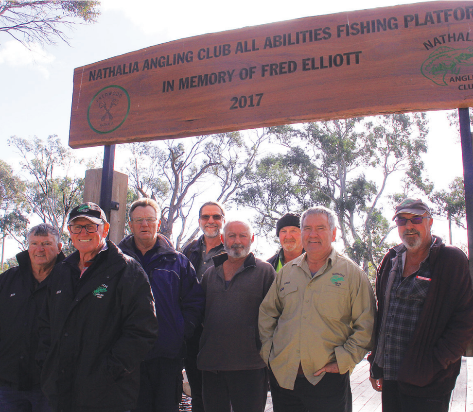
Big smiles ... Members of the Nathalia Angling Club weren't at all sad to see large fish released into the creek.