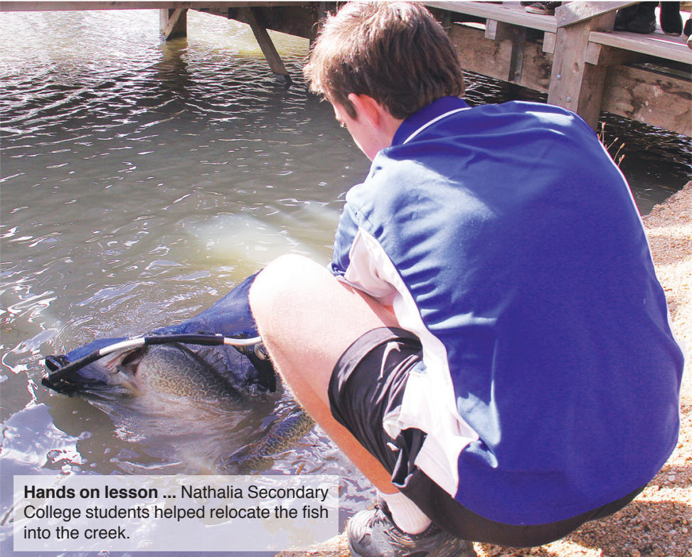
Hands on lesson ... Nathalia Secondary College students helped relocate the fish into the creek.