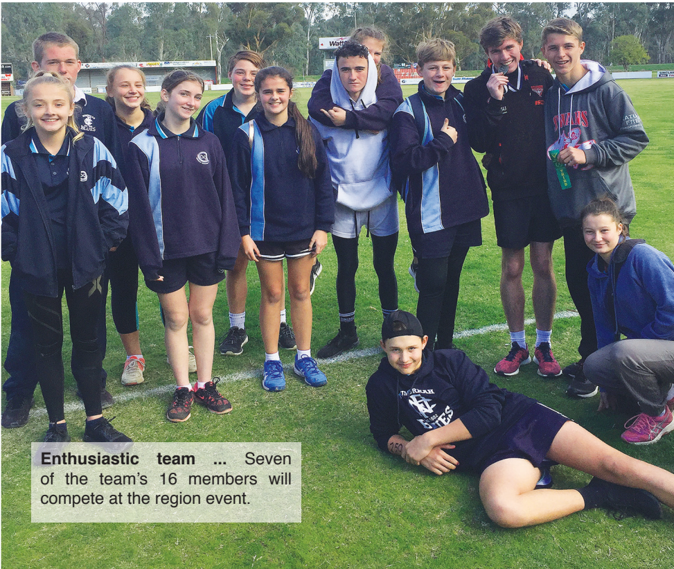
Enthusiastic team ... Seven of the team's 16 members will compete at the region event.